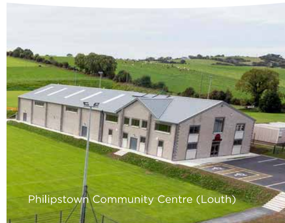
Philipstown Community Centre (Louth)