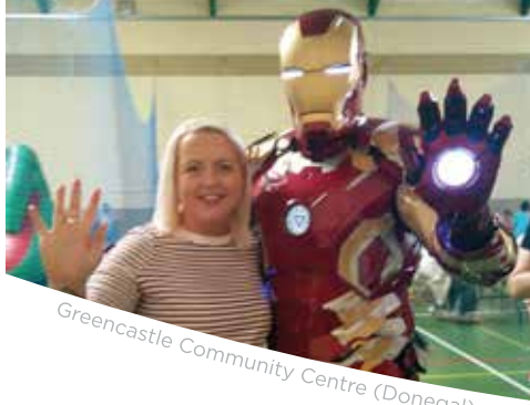
Greencastle Community Centre (Donegal)