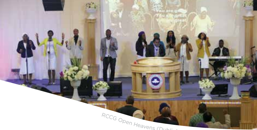
RCCG Open Heavens (Dublin)