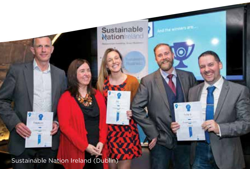
Sustainable Nation Ireland (Dublin)