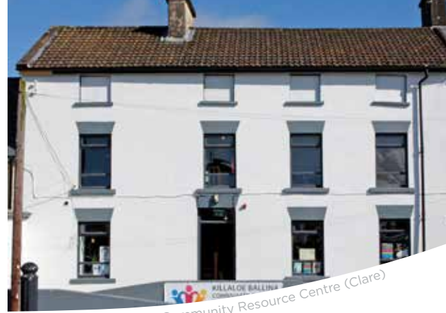
Killaloe & Ballina Community Resource Centre (Clare)