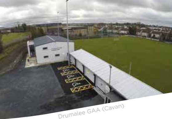
Drumalee GAA (Cavan)