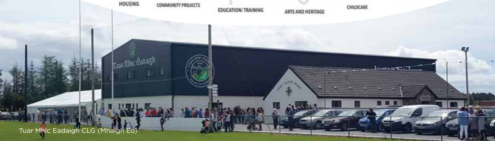
Tuar Mhic Eadaigh CLG (Mhaigh Eo)