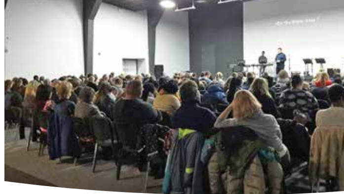
Abundant Life Church (Limerick)