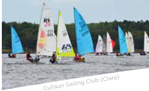
Cullaun Sailing Club (Clare)