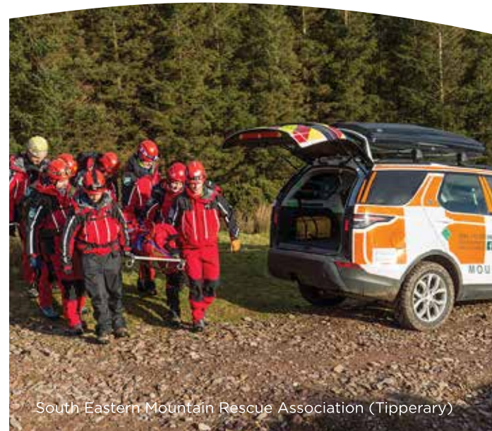
South Eastern Mountain Rescue Association (Tipperary)