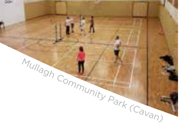
Mullagh Community Park (Cavan)