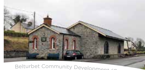
Belturbet Community Development (Cavan)

“ Commercial lenders were not in a position to help so we approached Community Finance (Ireland) who really understood the sector and how it was financed.